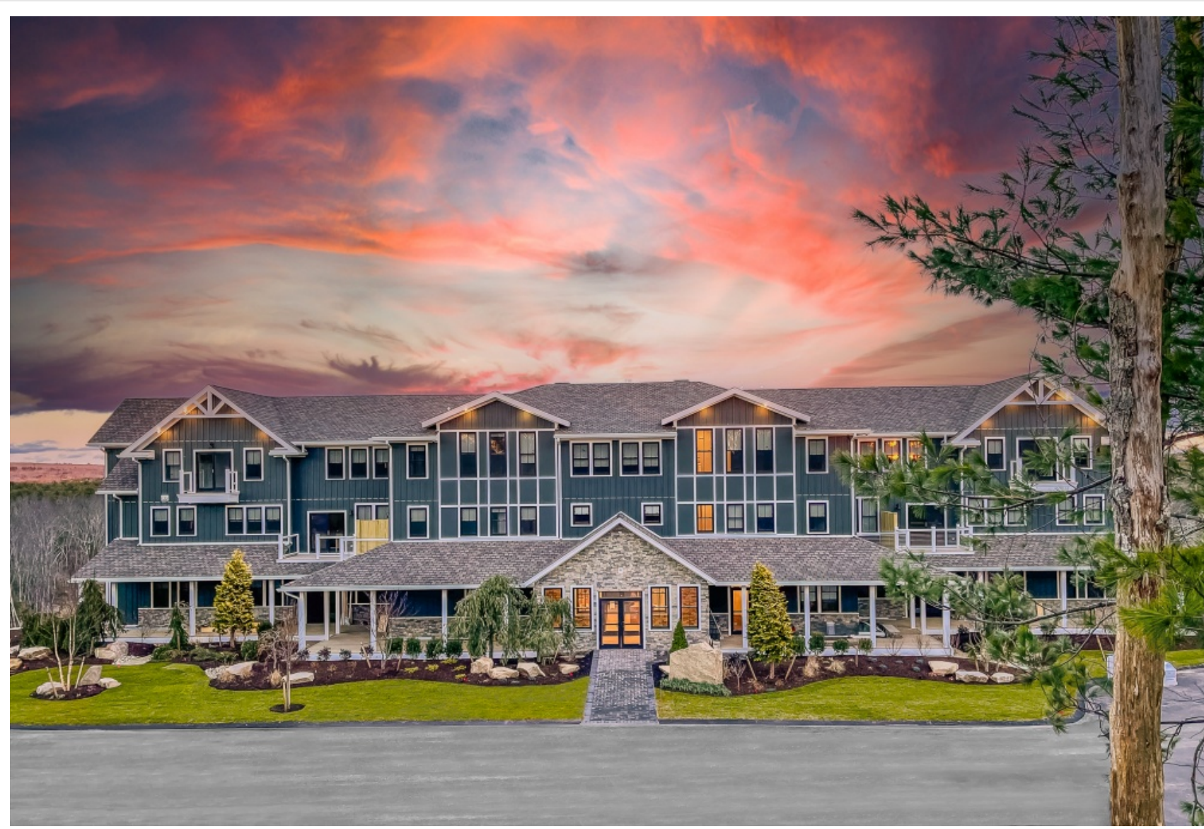
The Preserve Sporting Club in Richmond, Rhode Island

Stay at the Appalachian Mountain Club's flagship lodge, in one of the White Mountains' most alluring spots, and you lay claim to the expert guidance and free-to-borrow gear you need if you and your family aren't typically outdoorsy. Accommodations are varied and no-frills: You're here to spend your time hiking, climbing, biking, paddling, and observing wildlife and waterfalls. Even after a hearty included dinner, you'll want to venture out to peer at intensely sparkly stars.