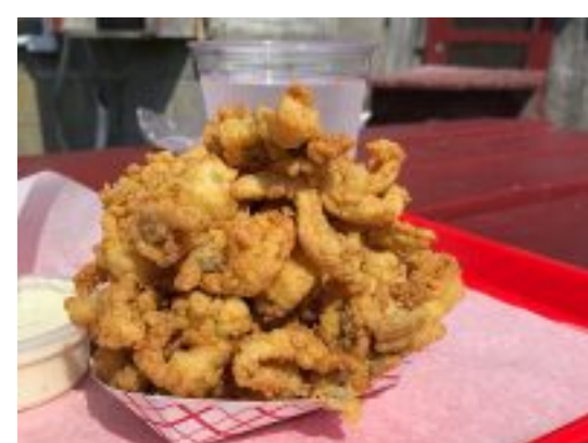
10 Best Fried Clams in New England