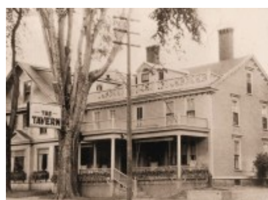
8 Most Haunted Hotels in New England