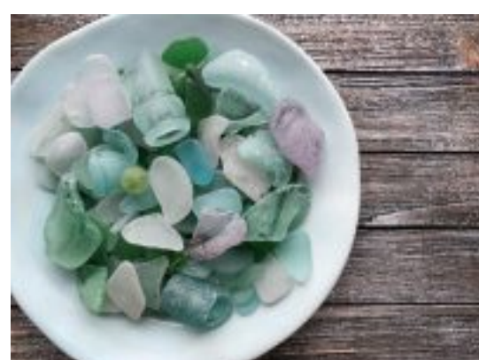
Best Beaches for Sea Glass in New England