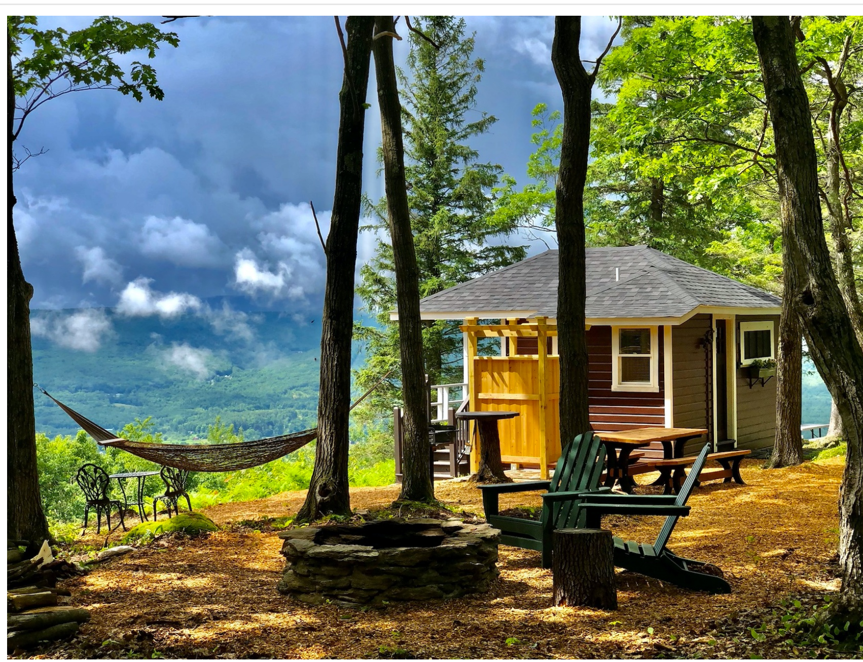
Wigwam Western Summit in North Adams, Massachusetts

Need more outdoor travel ideas? Find these picks, plus more than 120 of the best things to do, places to eat, and places to stay that celebrate the great outdoors in The Best of New England: Outdoor Edition .