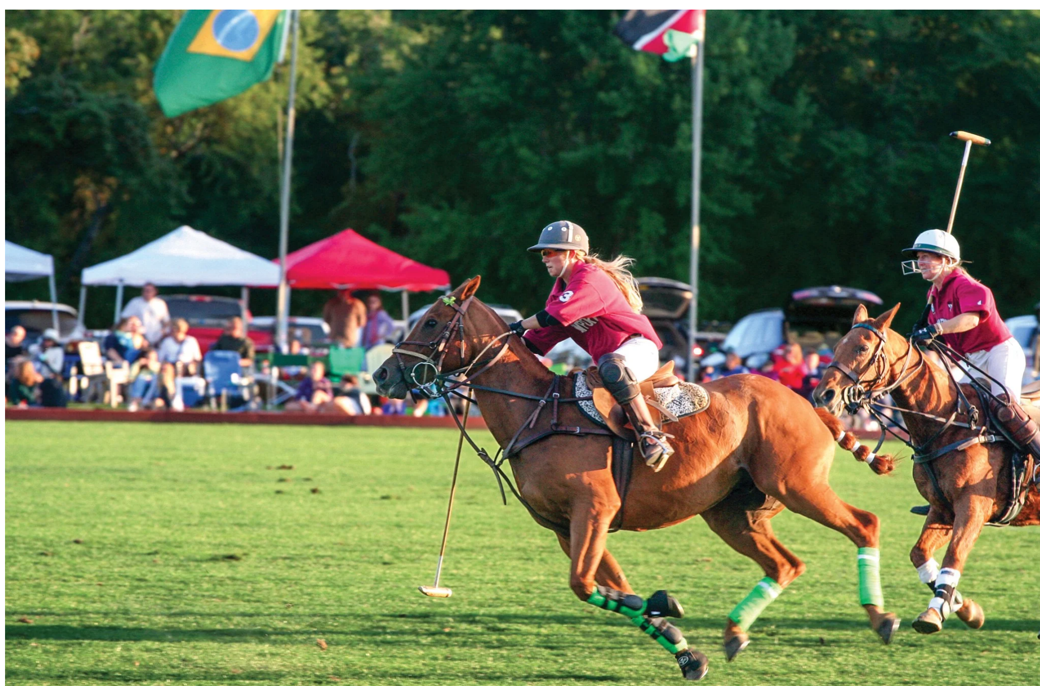
Experience the thrill of a polo match while picnicking on the grounds of Glen Farm in Portsmouth.

Pack a lunch and grab a spot on the famous polo grounds of Glen Farm. Originally used by Colonists for breeding prized livestock, the well-groomed fields and fully restored barn buildings are now home to the Newport International Polo Series. Situated just a short walk away from Sandy Point Beach, visitors can feel the ocean breeze flow over the open field. Just bring your own lawn chair, blanket and lots of sunscreen as there are few shady spots. The polo grounds are only available for picnics on game days with paid admission, sold at the gate or online. 250 Linden Ln., Portsmouth, nptpolo.com