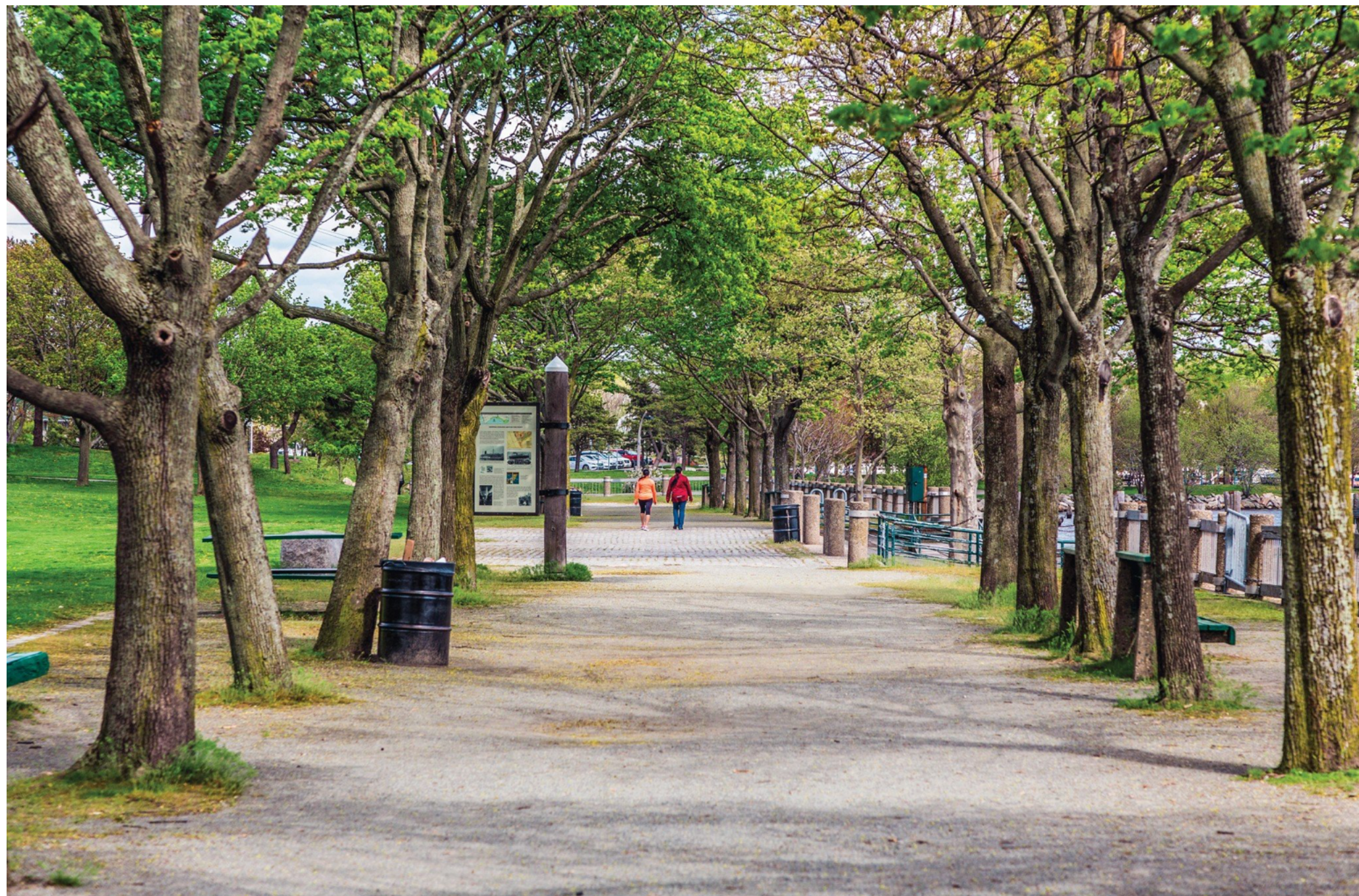
India Point Park.

Located at the base of the city with access to the Seekonk and Providence rivers, this open park has been home to many outdoor concerts, festivals (including the annual Cape Verdean Independence Day Festival and Rhode Island Seafood Festival), yoga in the park and more. The tree-lined park runs parallel to I-195 and has plenty of spots in the sun and the shade. Spread out a blanket on the hillside next to the cascading steps connecting to the East Side for full sun or park it on the dock. Grab a brewski at nearby Narragansett Brewery or extend the day with a ferry trip to Newport (the Providence ferry terminal is just steps away). For the kiddos, a giant jungle gym sits on the far east end of the park. 201 India St., Providence, friendsofindiapointpark.org