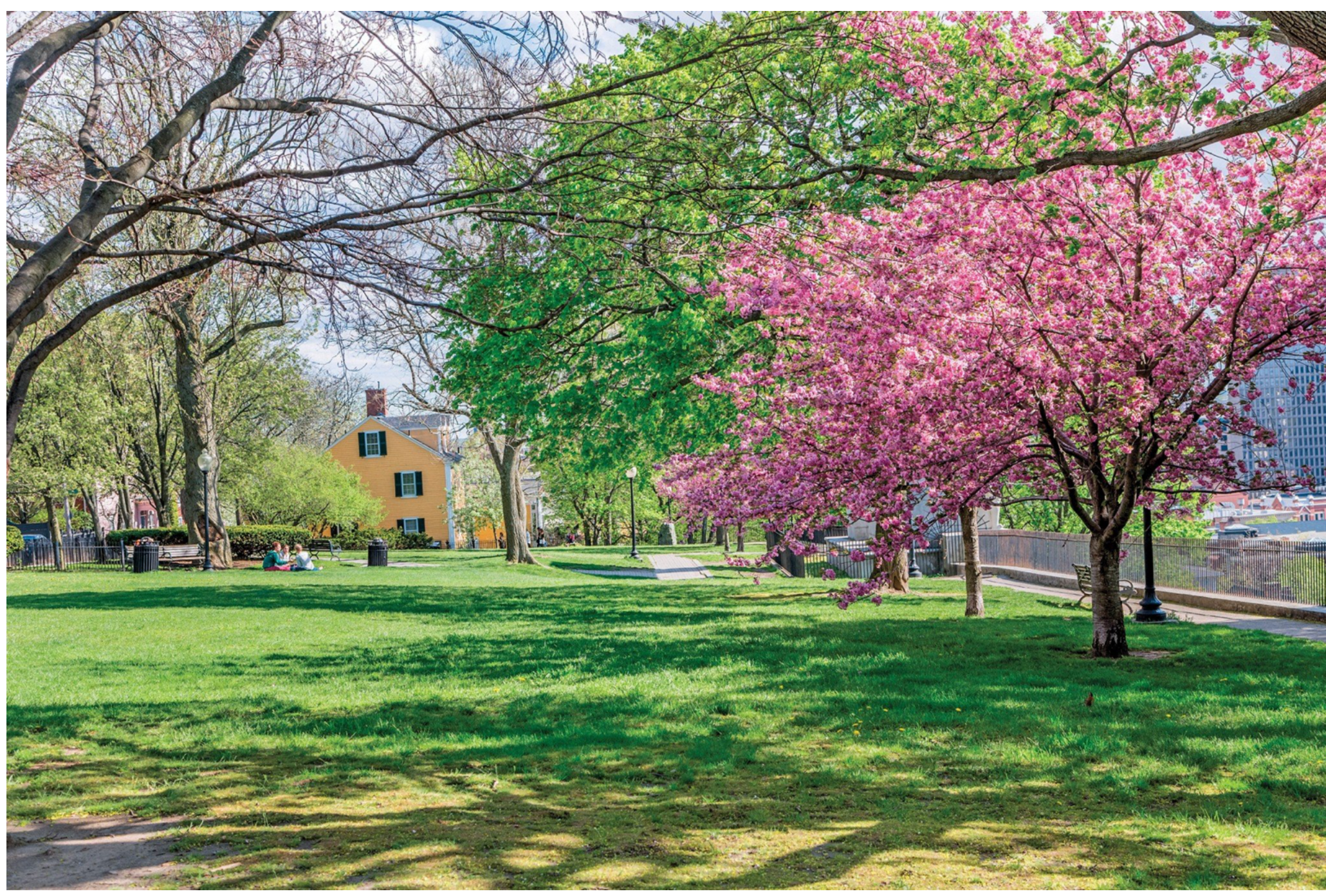
Prospect Terrace Park.

Overlooking the skyline of the capital, this hilltop park is the perfect spot for a city picnic without all the hustle and bustle. Located on the outskirts of the Brown University campus on the East Side, a historic statue of Roger Williams stands tall at the entrance facing west, and visitors (both local and out of town) can trace the skyline and identify some of the most notable buildings, such as the Superman Building and Providence Graduate Hotel. Catch spectacular sunsets as the sun slips below the horizon and illuminates the cotton candy sky. 60 Congdon St., Providence, visitrhodeisland.com