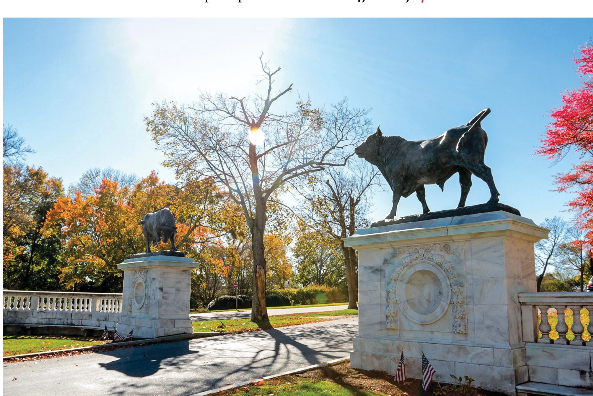
Bronze bulls at Colt State Park.

Know before you go: This park has a strict carry in, carry out policy requiring all visitors to dispose of their own trash elsewhere to keep the park clean. Route 114, Bristol, riparks.com