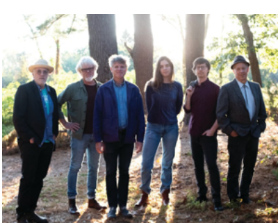
Session Americana collaborates at Askew