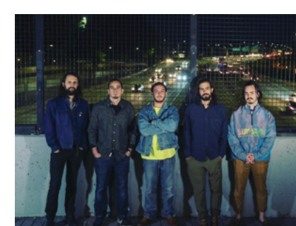
Northeast Traffic dive into the vault with self-titled album