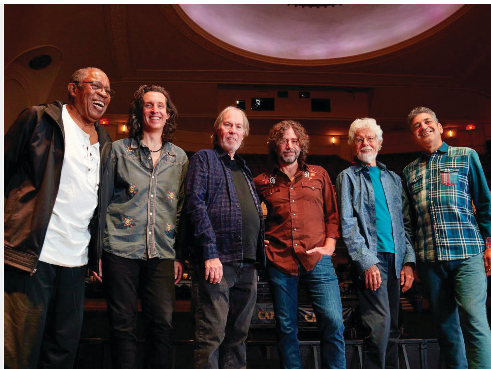
Little Feat brings their mixture of rock and roll, blues, country, R&B and jazz the stage at Rhythm & Roots on Sunday, Sept. 4