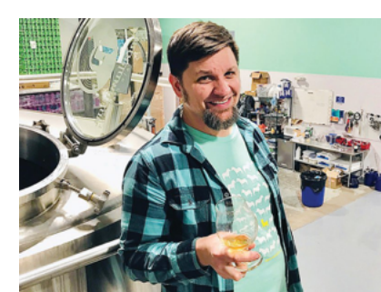
Daveapalooza returns to Proclamation Ale Co.