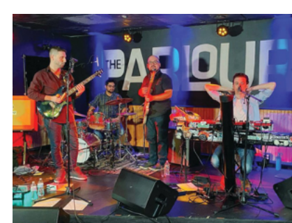
They Were Robots celebrate the season with new EP