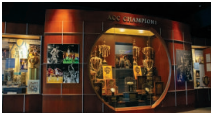
Clockwise from top left: Chapel Hill; UNC hoops fans; the Carolina Basketball Museum; Morehead Planetarium; a drink at The Crunkleton