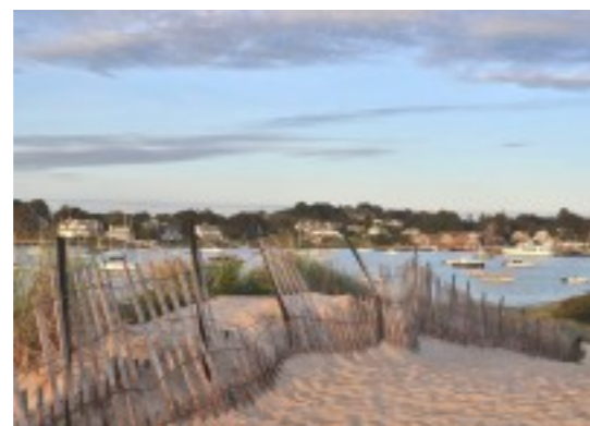
Things to Do in Westerly, RI | Coastal Weekend Getaways