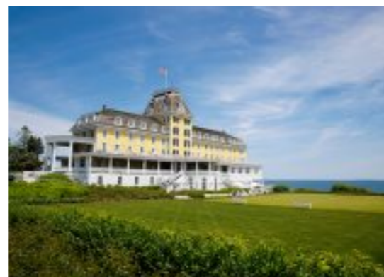
Guide to Westerly, RI | Hotels, Dining & Activities