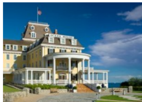
Ocean House in Watch Hill, Rhode Island | The Perfect Spot for a Seaside Lunch