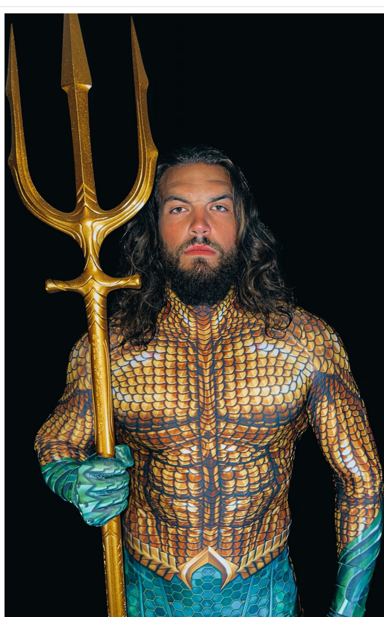
Kids are sure to love photo ops with jellyfish, seagulls, a mermaid, and an Aquaman impersonator.