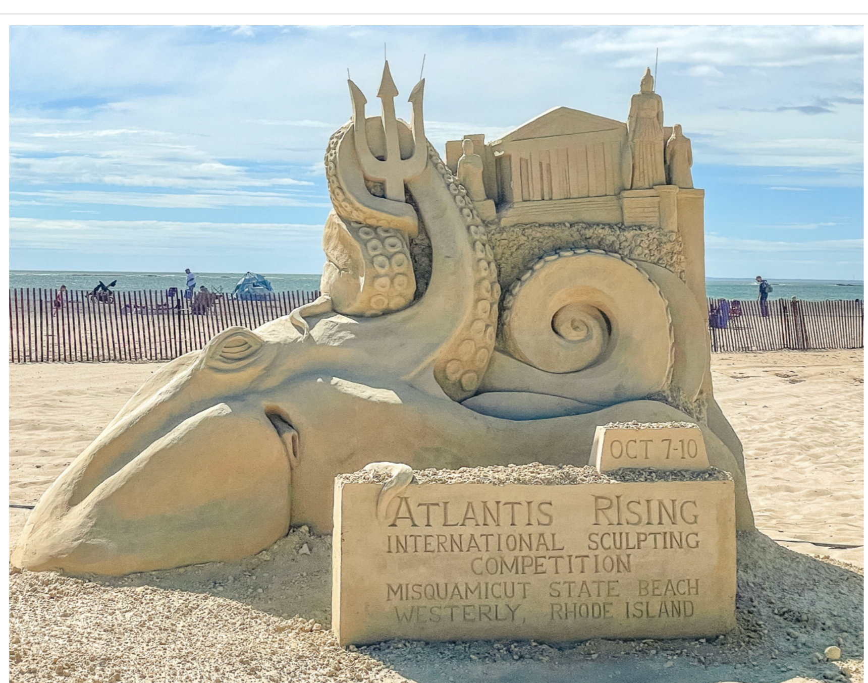
The first Atlantis Rising International Sand Sculpture Competition brings 10 of the world's top professional sand sculptors to Misquamicut State Beach in Westerly, Rhode Island, this holiday weekend. South County Tourism Council

The leaves may be changing, but in Rhode Island's South County region, there's a reason to head back to the beach this Columbus Day Weekend. The first Atlantis Rising International Sand Sculpture Competition lures 10 of the world's top professional sand sculptors to Misquamicut State Beach in Westerly, Rhode Island, to compete for honors and cash prizes, and a four-day event built around this spectacle is your chance to play in the sand, hear bands, and snap photos galore.