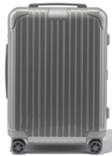
RIMOWA Essential Cabin 22-Inch Wheeled Carry-On

needed a pair of comfortable slip-on sneakers to hold me down while I got some steps in.