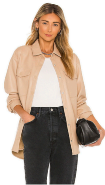
Bardot Frida Vegan Leather Shirt