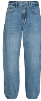
Frame The Lounge Cropped Jeans