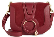
See by Chloé See by Chloé Hana Shoulder Bag