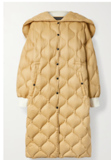
Rag & Bone Rudy Jacket