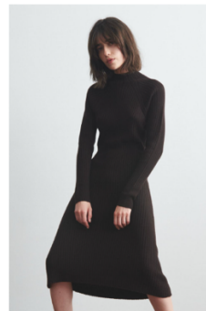
Thakoon Mockneck Sweater Dress