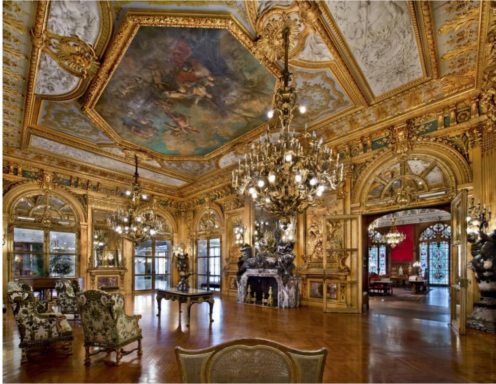
Marble House Gold room