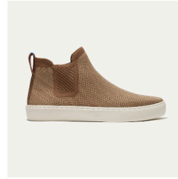
Rothy's The Chelsea