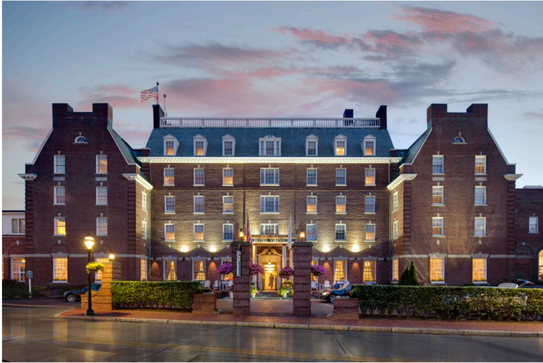
The Hotel Viking at dusk