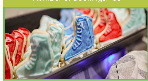
Decorated skate cookies were a delicious delight for

Future Hotel Room Nights Booked: 14,586 with an economic impact of $5,671,201.