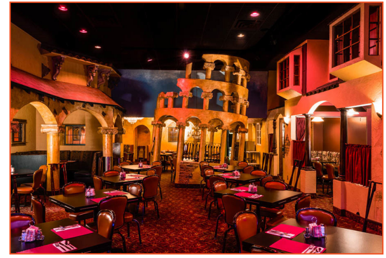
Lino's Restaurant in Rockford won the "Best For All"award for 2023 Rockford Region Restaurant Week.

The plan will be completed by June 2024.