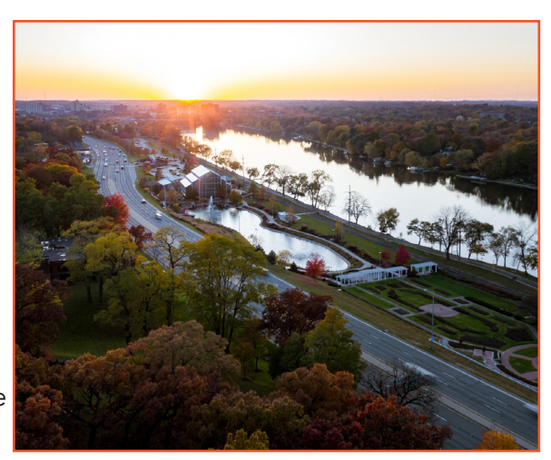
The Rock River is one of the assets that attracts visitors.

We will rely on a variety of perspectives to set the course, ensuring the diversity of our community is reflected in final recommendations of our master plan.