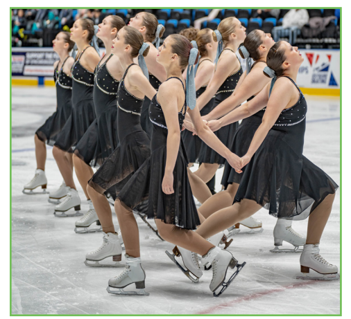
A synchronized skating team performs their program.