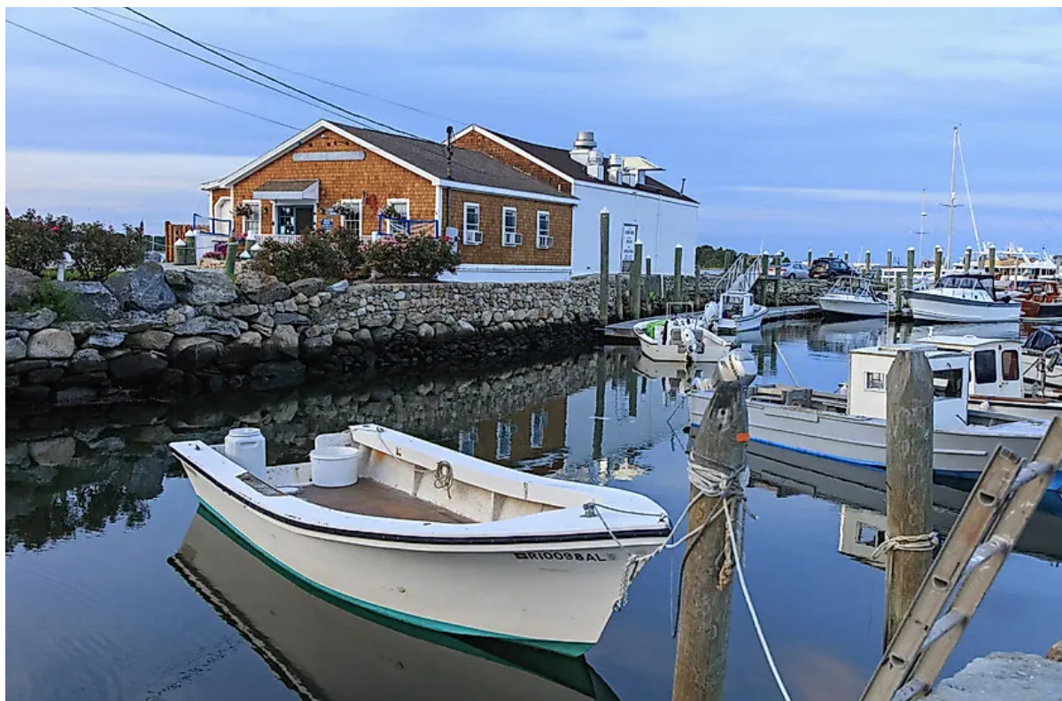
Waterfront view of North Kingstown, via North Kingstown | South County, Rhode Island (southcountyri.com)

Positioned along the south end of Rhode Island, it boasts a population that ranges around 26,100 people. The result is a quaint main strip that includes Wilson Park and access to Martha's Vineyard Fast Ferry and the Gilbert Stuart Museum. The town provides a charming blend of suburbia and rural influences. Its official Main Street, also called Tower Hill Road, is a high-energy zone filled with shops, diners, and various events in the community. For fresh produce, Casey Farm is a must-see historic site. Adventure seekers can enjoy the Wide World of Indoor Sports and work up an appetite for El Tapatio, Inside Scoop, or Shayna's. North Kingstown stands out for its fortified farmhouse, dating back to the 1600s. Known as Smith's Castle, it shows the resilience of the area through time. Complete with museums, mainly with a focus on the navy and aircraft, North Kingstown provides opportunities for relaxing, learning, and embracing nature.