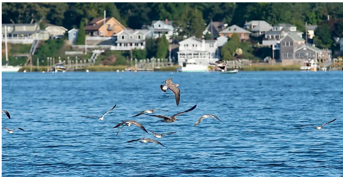
Seagulls over Greenwich Bay Harbor Seaport in east greenwich Rhode Island

East Greenwich is a Rhode Island town with an impressive main street. Its attractions mirror the pristine conditions of the town's surroundings. The Varnum House, the Memorial Armory, and the New England Wireless Steam Museums all speak to local culture. Science buffs can face a challenge at the RI Riddle Room With around 13,200 residents, this East Greenwich is active and engaging during any season. These attractions include gorgeous views of the west part of Narragansett Bay and allow for a perfect sunrise or sunset on this small island state . Spread across a broad area, the town's design matches the geography. East Greenwich has a range of history, including colonial and traditional architecture. Complete with high-class cuisine, it provides ample opportunity to explore the outdoors and return to the main street with an appetite. Visitors can find great options at Clementine's Homemade Ice Cream or Wild Harvest Breads and Cafe, sitting back and embracing the quintessential Rhode Island experience.