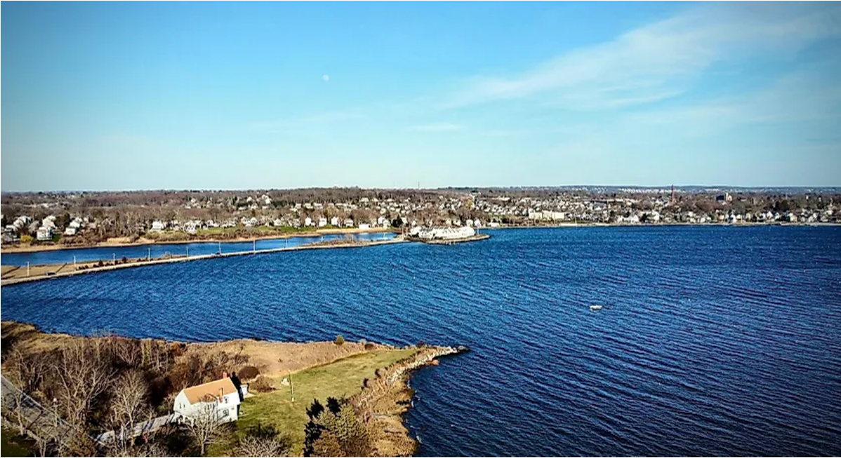
Aerial view of Papa Squash Road and the bay in Bristol, Rhode Island

Bristol has a lively main street, featuring unique eateries like Mt Hope Farm, the Wood Street Cafe, and Twelve Guns Brewing. Museum fans can embrace the Blithewold Mansion, Gardens & Arboretum, while history buffs can take a stroll through Independence Park. For families, Bristol has a Play Town that keeps tots engaged and lets parents relax. Home to around 24,600 people, the town of Bristol has incredible significance in Rhode Island and the USA. It hosts a renowned July 4th parade, the longest continual Independence Day event in the United States. The main street incorporates impressive shops and boutique options, paralleling the pride it shows in history and culture. With landmarks like the Arborium and Blithwold Mansion, its eastern location provides unique access to Narragansett Bay. It's a major tourist attraction for its beautiful views and high-quality amenities.