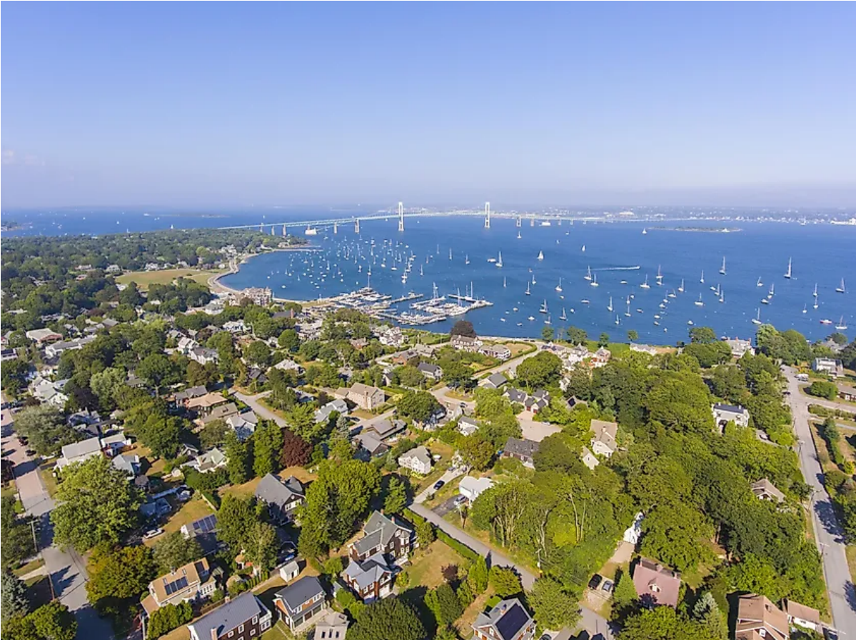
Claiborne Pell Newport Bridge on Narragansett Bay and an aerial view of Jamestown, Rhode Island

Jamestown provides access to the gorgeous waterfront. It provides visitors with a view of the Newport Bridge, the architecture juxtaposes with a purely natural landscape to create a unique experience. Its main street is replete with historic significance, including the Conanicut Battery and the Jamestown Windmill. Visitors can enjoy the Jamestown Newport Ferry, the local arts center, and learn about glass blowing at Clancy Designs. Right alongside Narragansett Bay, its position on Conanicut Island gives it a unique scenery that features a real panorama. For hiking enthusiasts, it connects with Beavertail State Park , known for the pursuit of the lighthouse. Mainstreet highlights all these virtues with its charming walkways, bakeries, eateries, and shops. Home to approximately 5,400 residents, Jamestown has a charming main street.