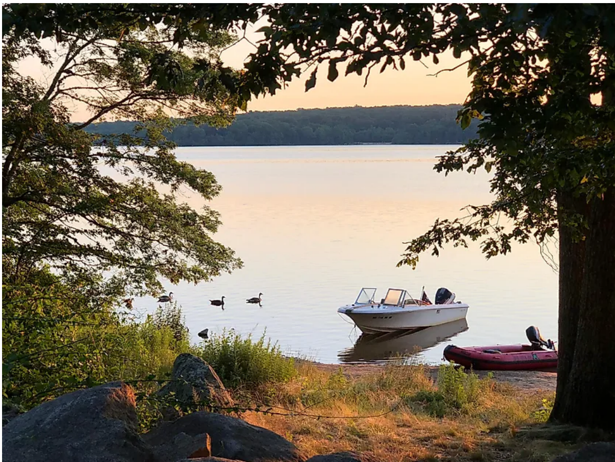
Two small boats at sunset at Watchaug Pond in Burlingame State Park, Charlestown Rhode Island

Unmistakable in its unique natural beauty, Charlestown features an observatory and a national wildlife refuge. Its main attractions include the Frosty Drew Observatory and Science Center, the Breachway Grill, and Simple Pleasures, a gift shop. Whether seeking a taste of the past at the Vintage Cigar Lounge & Club or looking for some calm at Quonny Yoga, there's something for everyone. Charlestown's coastal geography includes the Ninigret Pond, technically a lagoon that allows people to fish and swim. Its natural ecosystems attract birds and a range of fauna. Charlestown's main street is calm , matching the town's size. The shops and dining options line the main section that looks out to the beach, enticing visitors to engage in nature and nourishment. Home to approximately 8,100 individuals, Charlestown is a small but mighty part of Rhode Island.