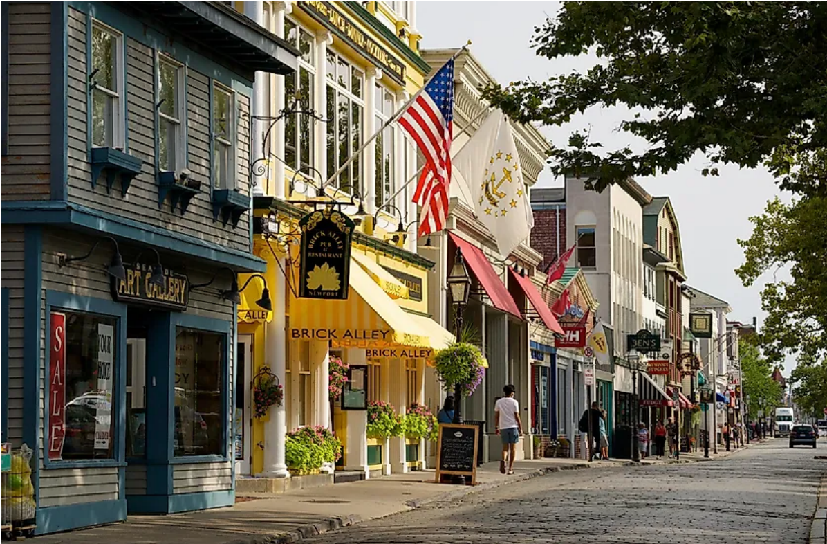
The historic seaside city of Newport, Rhode Island features iconic architecture, whimsical signs and colorful displays of nature, via George Wirt / Shutterstock.com

Newport boasts an impressive main street, featuring the Marble House, the Touro Synagogue National Historic Sight, and Rough Point, each a museum drawing active interest from tourists. After gathering an appetite, there are plenty of fine-dining options, such as The Mooring or the Black Pearl, ideal spots for