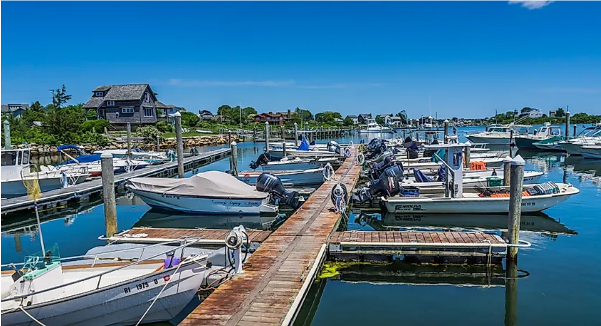
Matunuck Marina during summer is filled with boats

Many of the smaller Rhode Island towns incorporate history, but outside of the museum and the South Kingston old jailhouse, it mainly focuses on the natural beauty of the area. This shows in its Kinney Azalea Gardens, the Farmer's Daughter garden center, and the Old Mountain Field Park. With invigorating energy, the geographical landscape incorporates farmlands and sprawling hills that provide a picturesque view of the ocean. Its main street highlights this serenity , with local boutiques and non-chain eateries like the Matunuck Oyster Bar. During the right season, it hosts a theater by the sea each year and features play that call on history and current local talent. Otherwise, you can visit the All South County Luxury Cinemas to escape a rainy day. Also known as Wakefield-Peacedale, Southern Kingstown is unique in its quiet presence, despite its population of around 30,000 people.