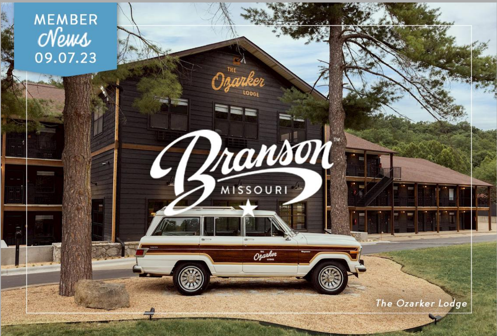
The Ozarker Lodge