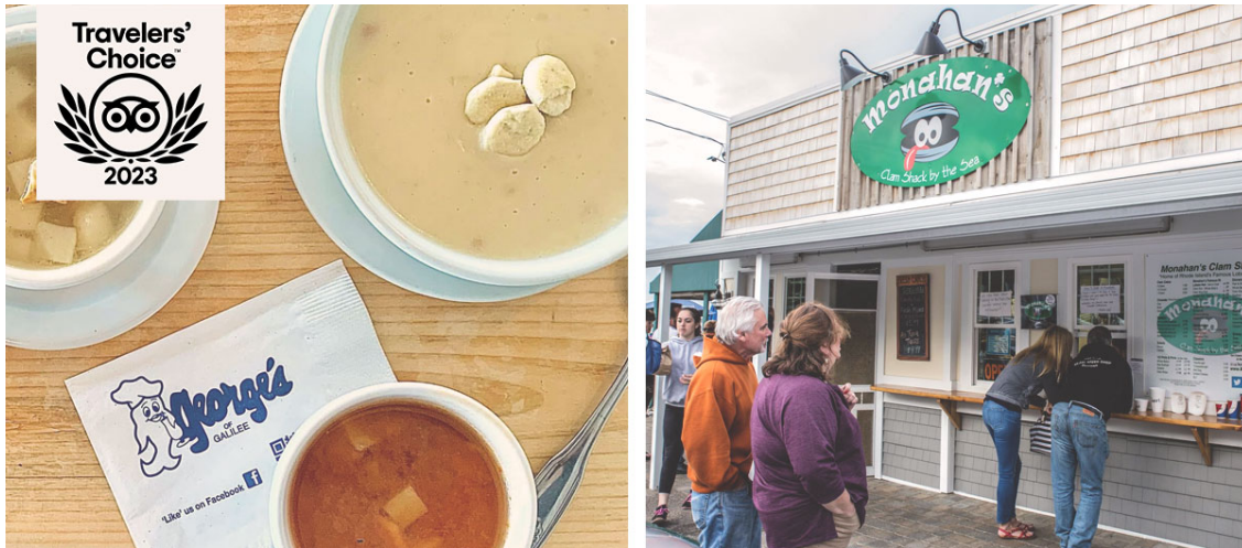
George's of Galilee (L), Monahan's Clam Shack (R)

George's of Galilee in Narragansett - You thought New England and Manhattan chowder were good? Wait till you try the clear broth Rhode Island chowder—and this is the place. The restaurant—which overlooks the fishing port of Galilee—is also committed to serving sustainable seafood caught right nearby.