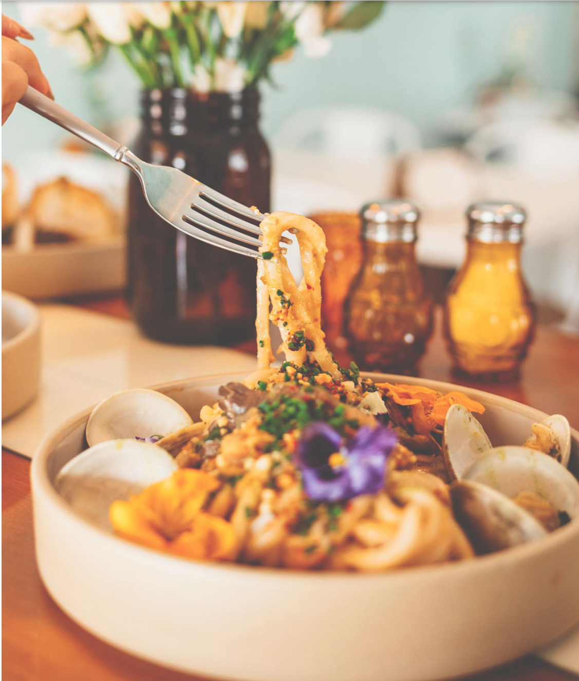
The Kitchen at The Surf Shack

The Kitchen at The Surf Shack in Narragansett - Camara combines influences from around the globe in dishes like the fan favorite Mo's Dan-Dan Clams, a mildly spicy udon noodle dish with a Chinese mala chili sauce base, coconut milk, and Manila clams topped with peanuts. According to Camara, the crispy pork belly steam buns and lamb ribs are also crowd-pleasers.