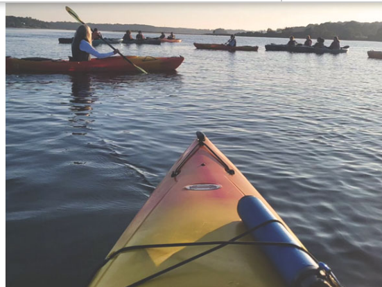
Narragansett Beach (L), Narrow River Kayaks (R)