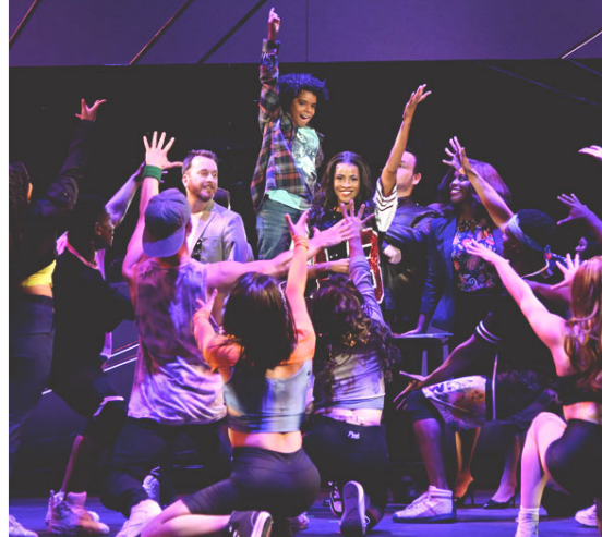
Tomaquag Museum (L), Theatre By The Sea (R)

If you want to take in local history, avant-garde culture, or serious summer stock theater, you're in luck.