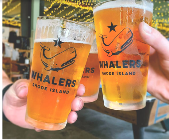
Georges Beach Tiki (L), Whalers Brewing Company (R)