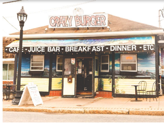
Breachway Grill (L), Crazy Burger (R)