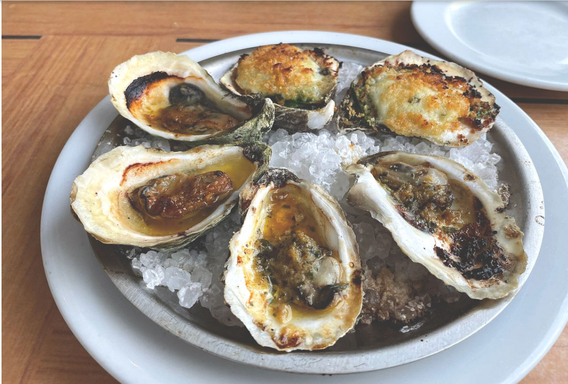
Matunuck Oyster Bar