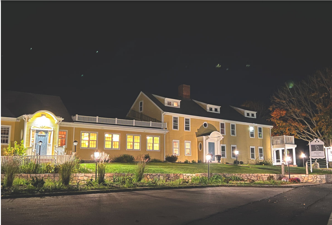
General Stanton Inn

If you're into small hotels with tons of charm, you'll be spoiled for choice in South County.