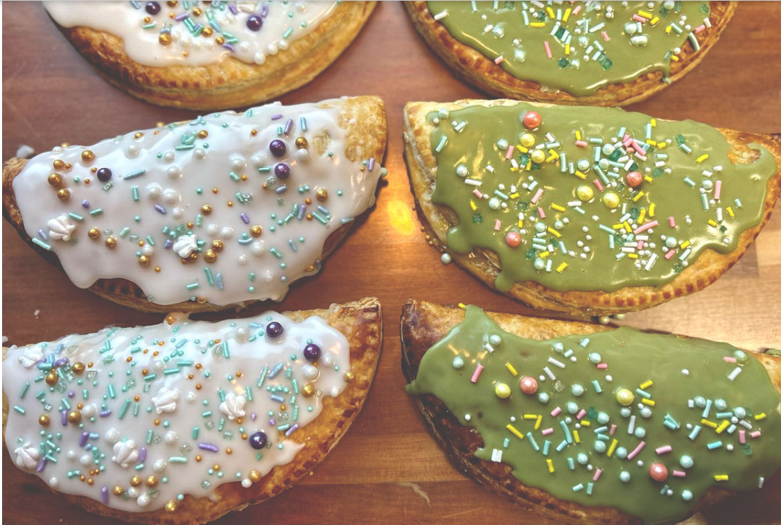
Queen of Cups

Dave's Coffee in Charlestown - "Dave's breakfast sandwiches and coffee are the best. I love to stop there on my way to the beach and our son, Kees, loves their chocolate chip sea salt cookies," says Keriann. "You can take the food to go or sit in their magical garden."