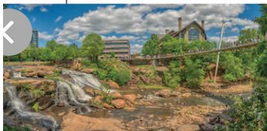
FALLS PARK ON THE REEDY

Travel to Greenville for a meeting and you'll be immersed in a culturally rich community of roughly 70,000 residents,