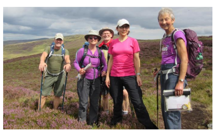
"The going was very 'heatherly' as one person put it!"

"It had its ups and downs" Laura Northall