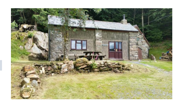
3<sup>rd</sup> – 5<sup>th</sup> November November bunkhouse weekend Broughton Farm bunkhouse, near Bishops Castle,

Broughton Farm bunkhouse, near Bishops Castle, sleeps 12 in two dormitories. Walks, cycling and I am led to believe a decent pub are amongst the highlights of this area.