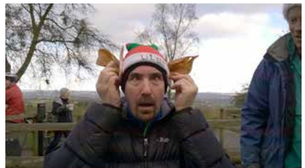
Photo of the Month Christmas Elf