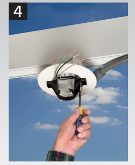
Attach fan/fixture bracket to structural member using supplied screws (#12 x 4"). Connect wires and install fan/fixture per manufacturer's instructions.