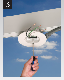
Attach medallion to box with supplied #8 x 1-1/4" screws.