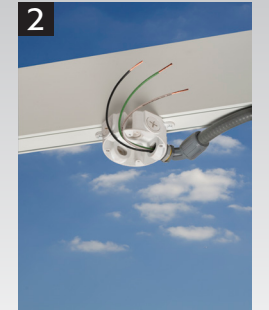
Pull wire (not included).

Install fitting with conduit. Seal unused openings with supplied plugs. Mount box to structural member.