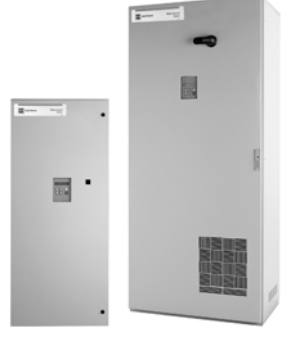
Harmonic Correction Units

Active harmonic filters provide active harmonic control. The active harmonic filter will monitor the distorted electrical signal, determine the frequency and magnitude of the harmonic content, and then cancel those harmonics with the dynamic injection of opposing current. Active harmonic control provides the benefit of traditional passive filters with simpler engineering requirements, easier and less expensive installation, comprehensive control, and assured compliance with the IEEE® 519-1992 standard.