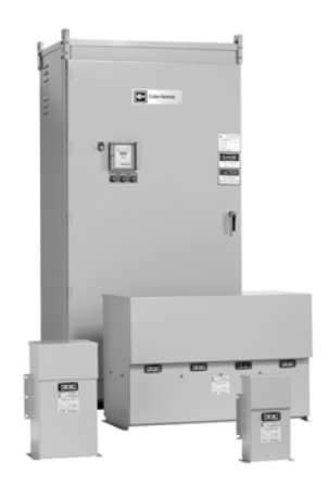
UNIPAK and AUTOVAR