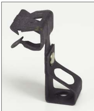
With Thread Impression