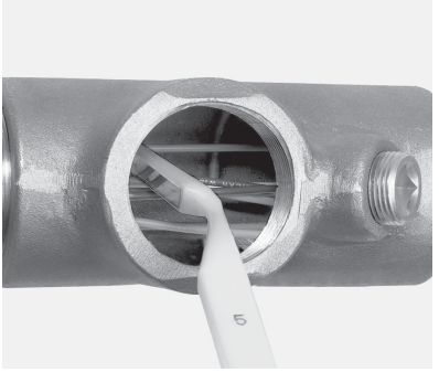
The mirrored tool allows for proper inspection of the fiber dam in difficult to see areas.