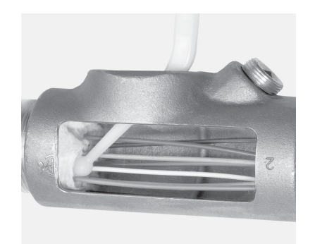
With one of the packing tools, packing fiber in between and around electrical conductors is effortless.