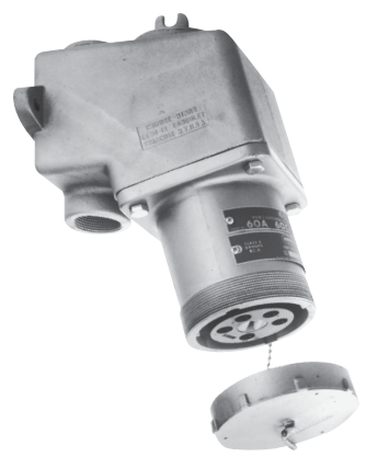
SRD Receptacle with threaded cap