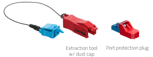
Extraction tool w/ dust cap Port protection plug

x = color: White (W), Yellow (Y), Orange (O), Red (R), Blue (L), Green (V), Slate (G), Black (E)