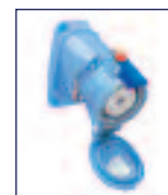
Female Receptacle with Angle Adapter 63-34043 + 61-3A027