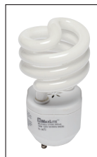
(2) 13W self-ballasted GU24 base CFL lamps included