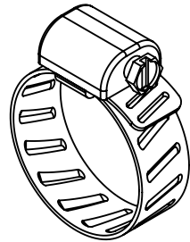
#10 MECHANICAL CLAMP, 9/16" - 1-1/16" DIAMETER RANGE (QTY. 1)