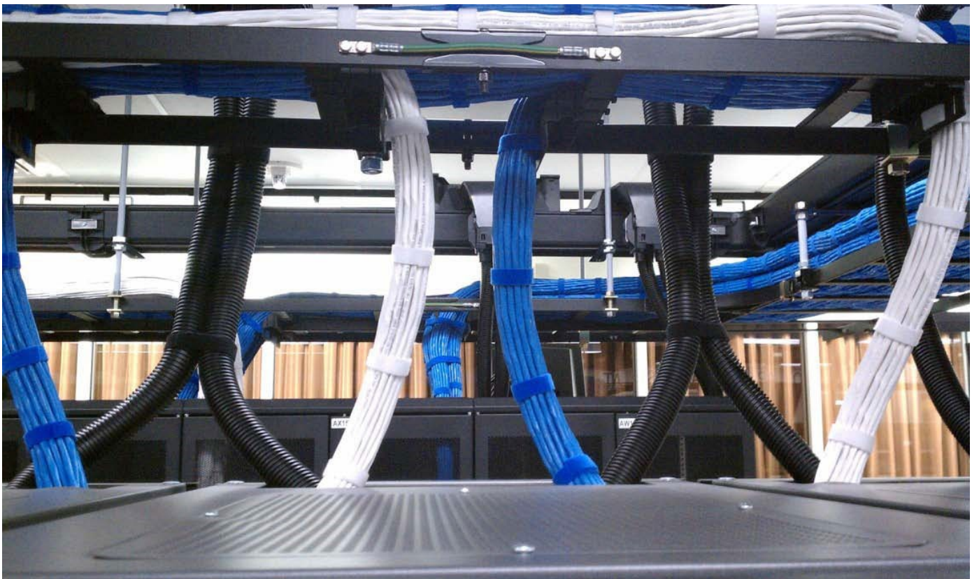
Figure 1. Color-Coded Server Cabinet Cabling Bundles in Panduit World Headquarters

Figure 1 shows color-coded copper cabling bundles leading from server cabinets. In many installations, the cabinet will contain in excess of 40, one RU profile servers. The server-to-switch connections are very often configured for two separate connections, referred to as primary and secondary connections (alternatively main and redundant). In this example, cables associated with the main connection are color-coded blue, and those for the redundant connection are white. Adherence to good labeling practices in the vicinity of the connections to equipment is followed to aid identification of specific cables at a later time. Color-coded hook and loop ties neatly support cable bundles without pinching and potential performance degradations associated with often used nylon cable ties. These cables will be connected to the patching fields for the servers within the cabinet.