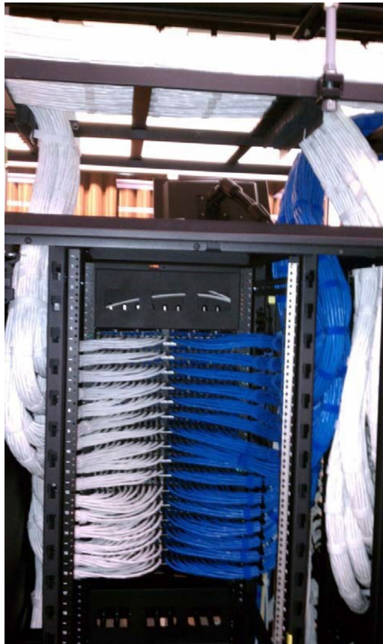
Figure 2. Switch Cabinet Patching Fields

Figure 2 shows the rear view of the patching fields for the switch. 192 cables each in white and blue enter the patching field. Patch cords are used on the reverse side of the cabinet to connect the terminated cables to the switch.