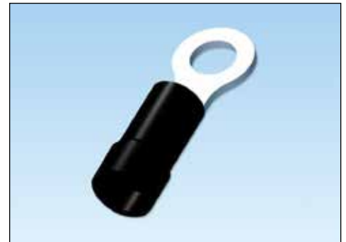
PV14-10R with Custom Color Black Insulation