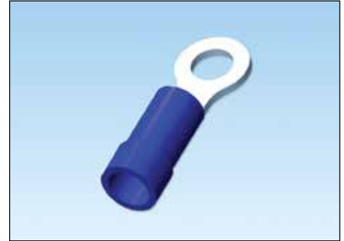
PV14-10R with Standard Blue Color Insulation

Consult factory to match specific color for your application. The ability to identify wire range from industry standard [Red (18 – 22 AWG); Blue (14 – 16 AWG); Yellow (10 – 12 AWG)] is lost when non-standard colors are used, as it is difficult to differentiate barrel sizes when insulation housings are all the same color.