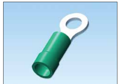
PV14-10R with Custom Color Green Insulation