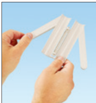
Open Pan-Wrap™ Tool and insert bundle.