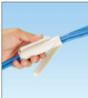
Close tool to contain bundle.