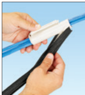
Insert Pan-Wrap™ Braided Sleeving onto end of tool until approximately 3" of it covers the bundle.