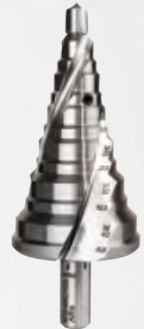
Prod.-No. o8o84 ■