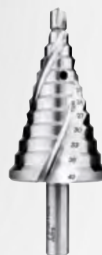
Prod.-No. o8o8o ■