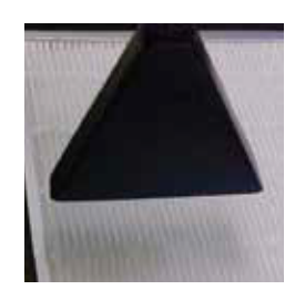
Scanning with light scattering photometer.