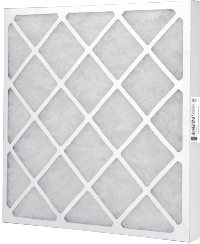
AmAir®/C-3 carbon panel filter

AmAir/C-3 2" panel filters are directly interchangeable with standard 2" air filters. The AmAir/C-3 panel offers more carbon density per square foot than the 2" pleated model.