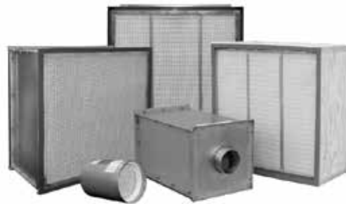
Nuclear and Biological Grade Filters