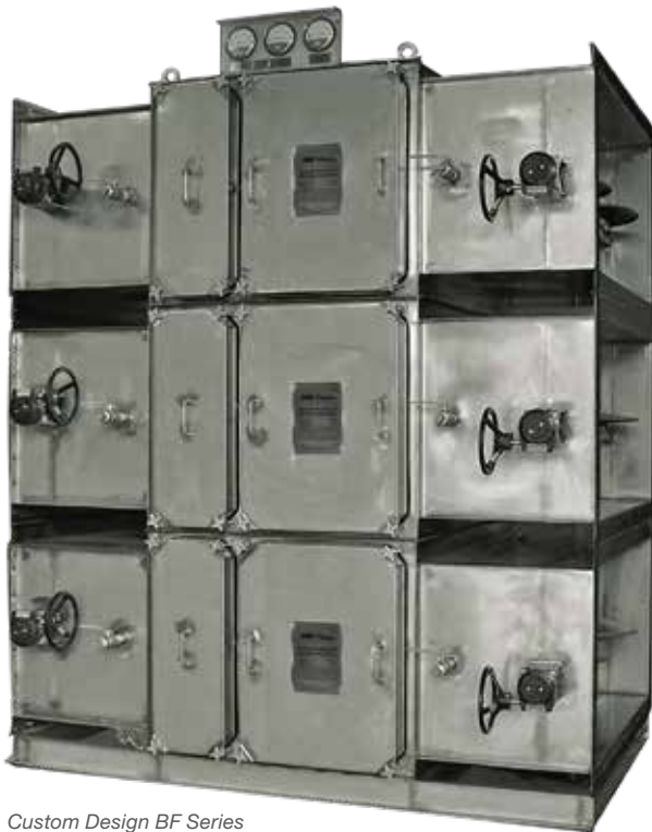
Custom Design BF Series with Isolation Dampers and Gages