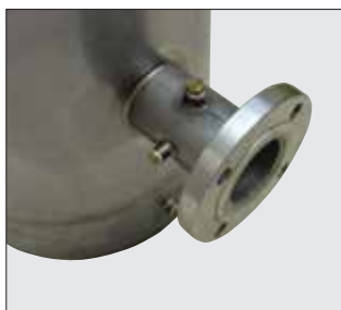
150 Lbs. Flange Test Port – Static Pressure Tap Drain Port