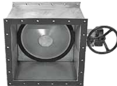
Square Bubble-Tight Damper – Used for isolation of a filter or a filter bank primarily during the filter changeout process.