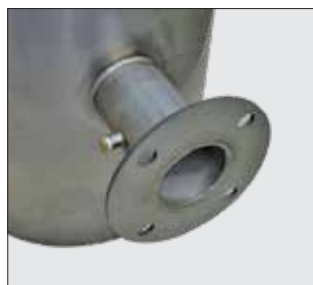
\frac{1}{4} " Thick Plate Flange – Static Pressure Tap