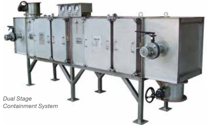
Dual Stage Containment System