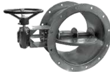
Round Bubble-Tight Damper – Used for isolation of a filter or a filter bank. This damper can also be used as a non-modulating control damper.

The bubble-tight isolation dampers are AAF top-of-the-line dampers. These dampers were specifically designed to provide cost-effective isolation of filter banks with high volumes of air. Each bubble-tight damper is leak tested at the factory to ensure a “bubble-tight” seal at a differential pressure of 10 inches water gage. Isolation dampers are available with the standard manual actuator or optional electric or pneumatic actuators.