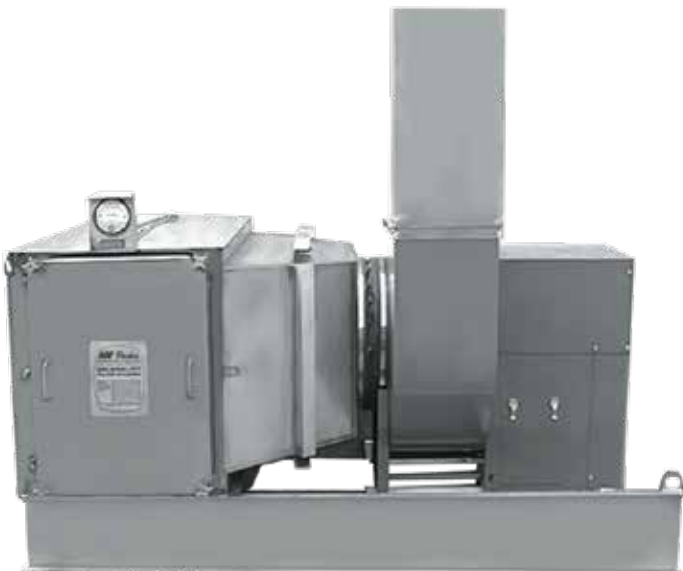
BG Series SC-1000 with Optional No-loss Stack