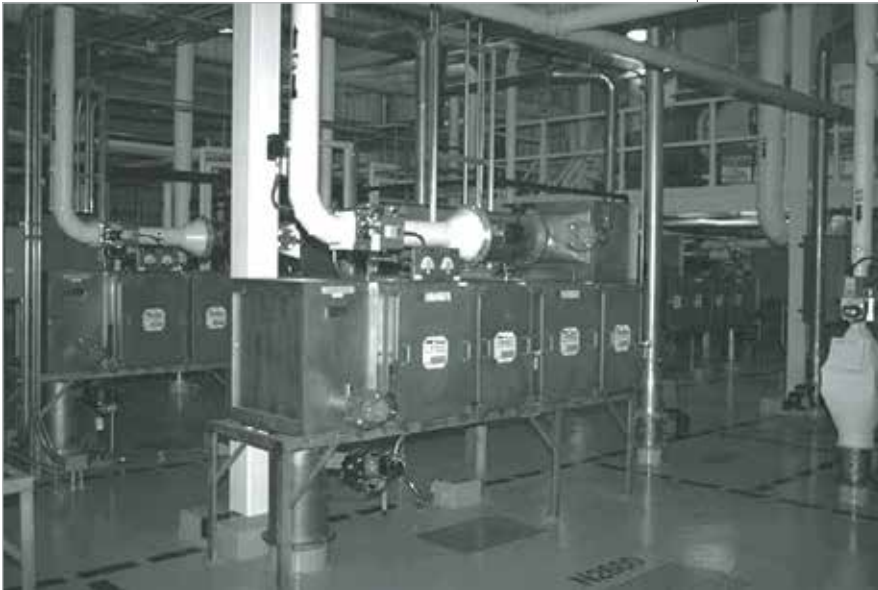
A variety of sizes are available for a wide range of airflows.

Some types of HEPA filters are routinely scan tested during factory production tests to locate pinhole leaks. Installations such as cleanrooms customarily use the scan test as an acceptance test. Scan testing, with the use of AAF PrecisionScan Test Sections, will also locate pinhole leaks in filters installed in side access filter housings.