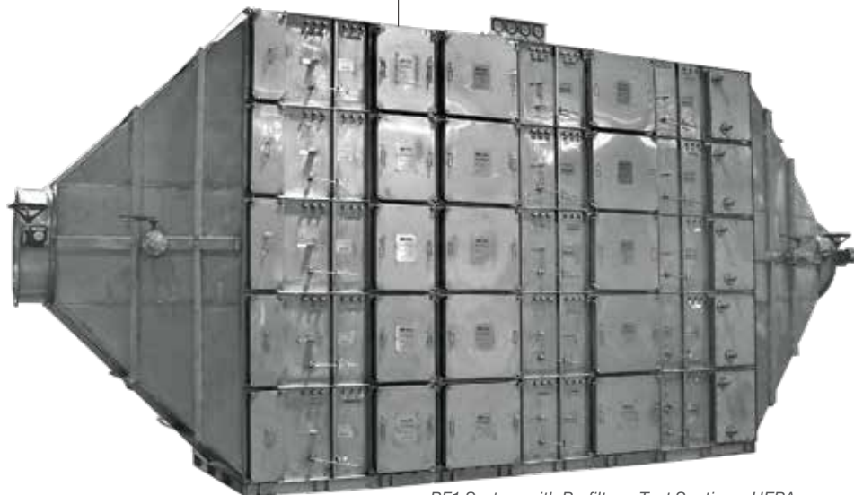
BF1 System with Prefilters, Test Sections, HEPA's, Transitions, Carbon Adsorbers, and Dampers