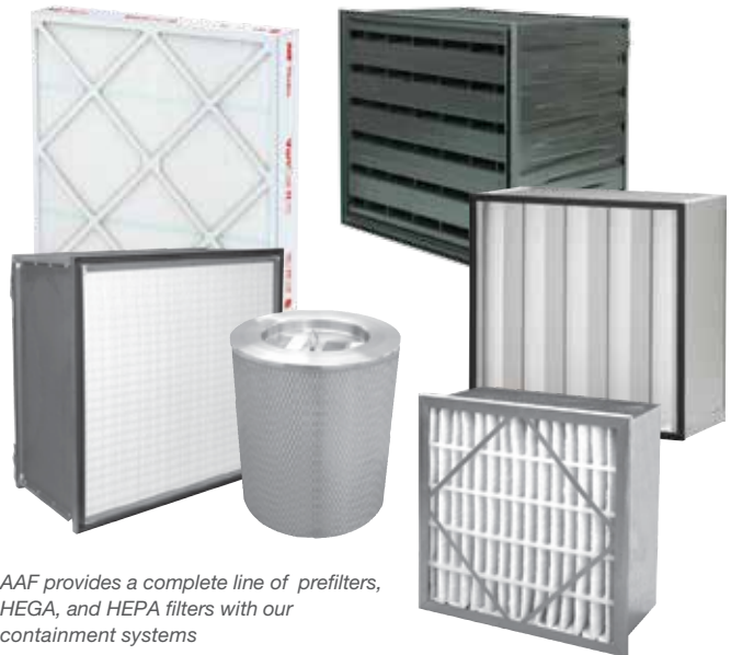
AAF provides a complete line of prefilters, HEGA, and HEPA filters with our containment systems