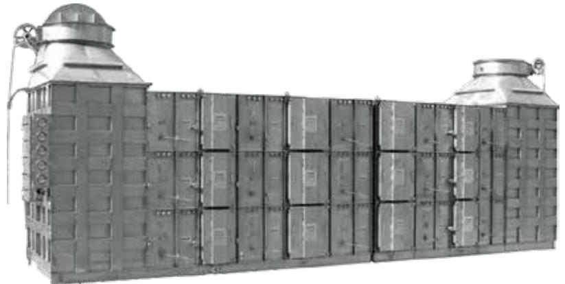
Custom Engineered CBR Filter System with Prefilter, HEPA, and HEGA Filtration

Customized manufacturing of total filtration systems allows AAF to match components accurately to the airflow rate and capacity, residence time, and other technical requirements. Installation of the system is also simplified, since a single manufacturer has responsibility from the inlet to the outlet of the system. We have manufactured products specified to meet Engineered Safety Feature (ESF) Systems and Non-ESF Systems in accordance with the requirements of 10 CFR 50 Appendix B.