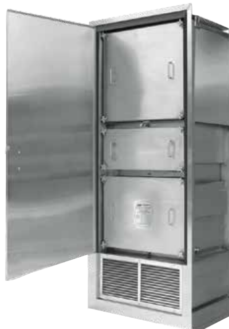
AAF Laminar Flow Wall Pharma Containment System

AAF products have established the benchmark for conscientious design in quality containment air filtration.