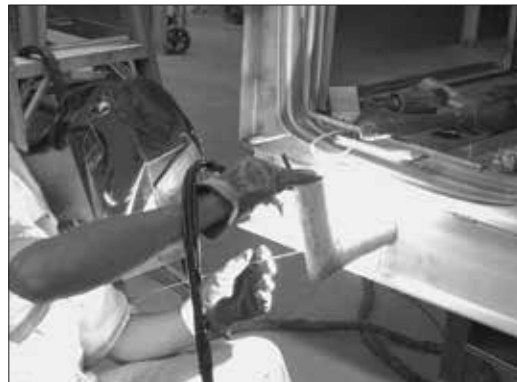
ASME, Section IX Qualified Welder Working on a Bag-in/ Bag-out Filter Housing

All welding procedures, welders, and welder operators are qualified in accordance with ASME Boiler and Pressure Vessel Code, Section IX. All production welds are visually inspected per AAF Standard Work Instruction WI-03-022, Visual Inspection of Welds, which incorporates the workmanship acceptance criteria described in Sections 5 and 6 of ANSI/AWS D9.1 Welding Code—Specifications for Welding Sheet Metal.