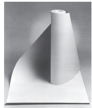
Our Paint Booth Floor Paper is available in a variety of widths.

Kraft paper available in a variety of widths to save time and money while protecting paint booth floors and surfaces from spills and oversprays.