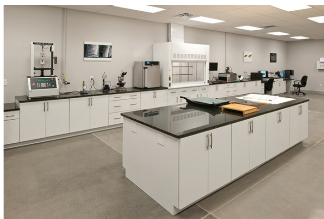
AAF operates its Clean Air Innovation & Research Center (Clean AIR Center) near its World Headquarters in Louisville, Kentucky.

Only AAF has a long history with deep, technical knowledge and archives to bring the experience, expertise, and reliable data to the customer. Our mission is to help you protect your environment, reduce your business risk, and optimize your clean air related spending. We will always strive to invest our time and expertise to help you improve your business, not just to sell you a product.