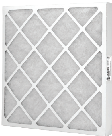
AmAir®/C-3 carbon panel filter

AmAir/C-3 2" panel filters are directly interchangeable with standard 2" air filters. The AmAir/C-3 panel offers more carbon density per square foot than the 2" pleated model.