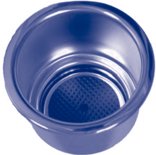
(1) Cup Holder only