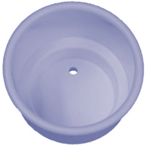
(1) Cup Holder only