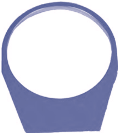
(2) Mount shown above (includes cup holder)