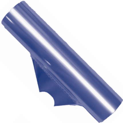
(1) Straight Style