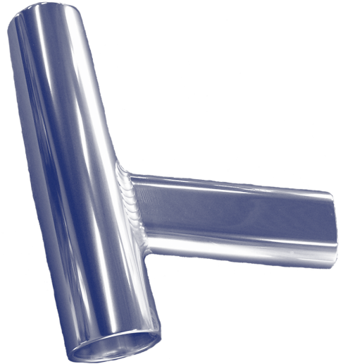
(1) Straight Style

Custom locking pin designed with a full radius to fit perfectly on all fishing roads!