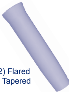
(2) Flared & Tapered