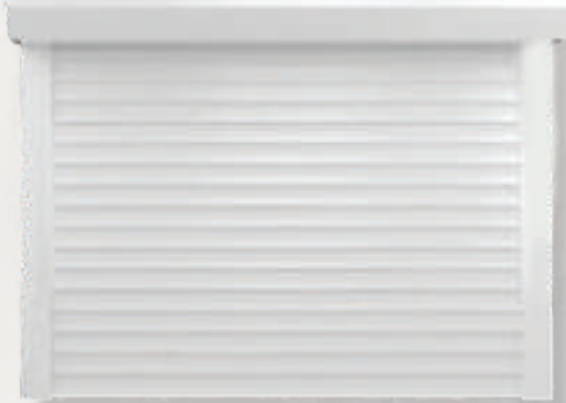
EA 44mm End Retention Aluminum Roll Shutter

Spans ranging from 5' to over 12' with loads from +93 to +40 respectively