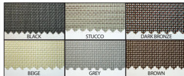
Suntex 90 Premium Solar