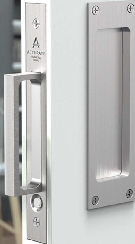
2011PDP PASSAGE SET EXPOSED FASTENERS

The 2011PDP is a Pocket Door Edge Pull featuring a large bale designed for passage, non-locking applications on space-saving doors. Also available as 2011PDP-Q Quiet Pocket Door Edge Pull featuring a quiet, slow-release edge pull. Pair with Blank Flush Pulls.