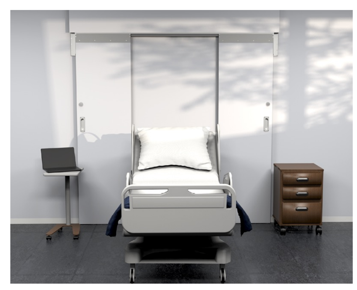
Locking to conceal medical gases