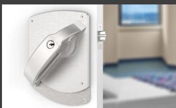
CH-CYL Crescent Cylindrical Set