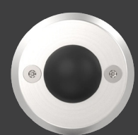
LR-WS Ligature Resistant Wall Stop