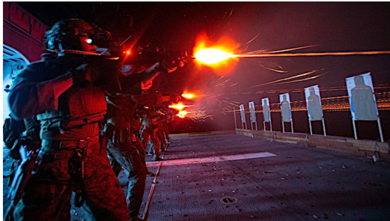
U.S. Marines with Force Reconnaissance Platoon, 31st Marine Expeditionary Unit, practice recoil management drills utilizing tracers during a deck shoot aboard the amphibious assault ship USS America in the Solomon Sea on Aug. 5, 2021.

The U.S. military and its courts are going to be looking deeply into religion soon, as the Biden administration has announced its demands for members of the U.S. military who want a religious exemption from the president's requirement that everyone take the experimental COVID shots.