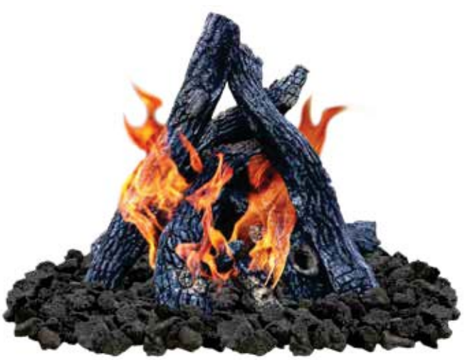
*LAVA ROCK NOT INCLUDED