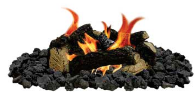
*LAVA ROCK NOT INCLUDED