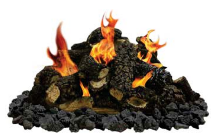
*LAVA ROCK NOT INCLUDED