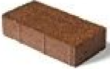
5 X 10 24 CM X 12 CM X 8 CM 9.5" X 4.75" X 3.125"