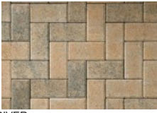
RIVER AVAILABLE IN CLASSIC AND ANTIQUE FINISH

Designed with special spacer bars, the resulting 7mm gap is filled with a clear, fine stone chip that allows rapid penetration of rainwater into the sub-base and subsoil.