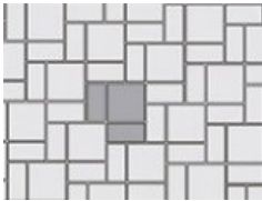
Eco-Priora H 5 x 10 (50%) 10 x 10 (50%)

Sold in full bundles only and shipped on refundable skids. Eco-Priora is available in Series 3000 and Umbriano finishes. Minimum quantities apply on custom orders. Textured surfaces require a buffer between the plate compactor and the paver surface to prevent scuffing. Specially graded aggregates must be used for the joints. Contact Unilock for more information.