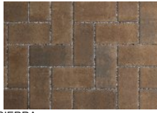
SIERRA AVAILABLE IN CLASSIC AND ANTIQUE FINISH