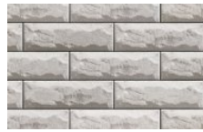
OPAL PITCHED FACE