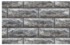
GRANITE FUSION PITCHED FACE