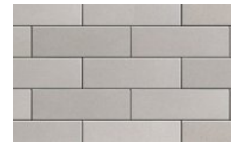
OPAL SMOOTH FACE