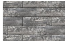
GRANITE FUSION SMOOTH FACE