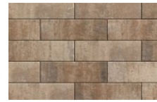
BAVARIAN SMOOTH FACE