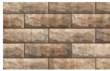
BAVARIAN PITCHED FACE