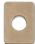
Light Box 8"W x 11"H x 1.5"D