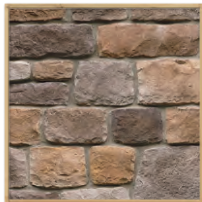
Warm Springs Heritage