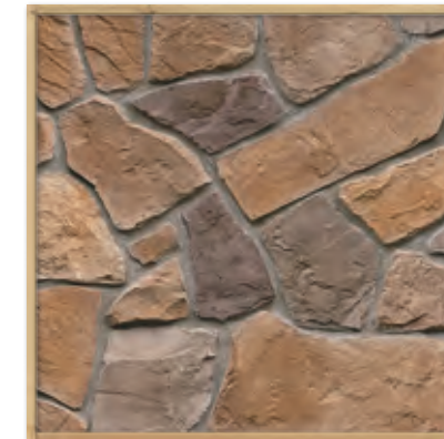
Warm Springs Fieldstone