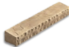
Rock Face Sill 19.75"W x 3"D x 2"H (FACE) TO 2.5"H (BACK)