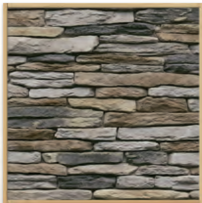
Pennsylvania Laurel Cavern Ledge