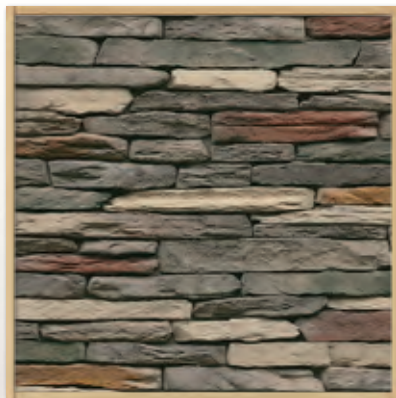
Tennessee Laurel Cavern Ledge