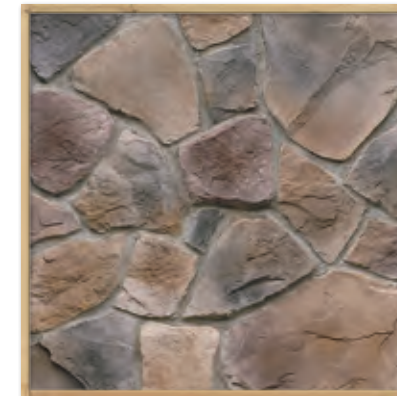
Valley Forge Fieldstone