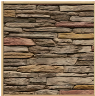
Chardonnay Laurel Cavern Ledge