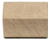
Peaked Wall Cap 20"L x 12"W x 2.375"-3.5"H 20"L x 16"W x 2"-3.5"H