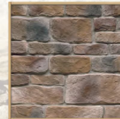
Valley Forge Cobble