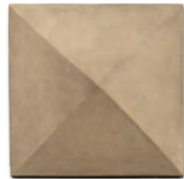
Pier Cap 26"W x 26"L x 2.5"-5.5"H