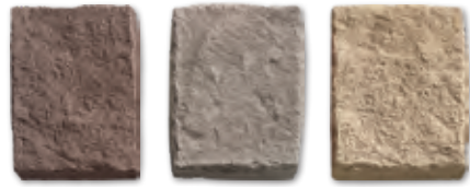
Espresso Grey Cream

StoneCraft accessories are designed to provide the finishing touch to any stone veneer application. Developed specifically to work in concert with any of our profile colors, each accessory is offered in three versatile colors.