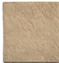
Hearthstone 19"W x 20"L x 1.5"H