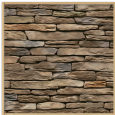
Asher Laurel Cavern Ledge

Laurel Cavern Ledge was meticulously crafted to create a timeless appearance. Handpicked from the rocky ravines and cliffs of North Carolina, this unique profile has rugged yet well defined features. Stones range from 1"-4¼" in height and 5"-18" in length.