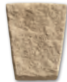
Keystone 8"-5.5"W x 10"H x 1.5"D