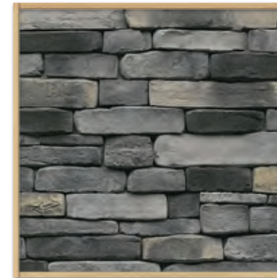
Kingsford Grey Ledgestone