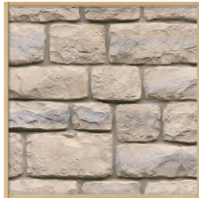
Old Ohio Heritage