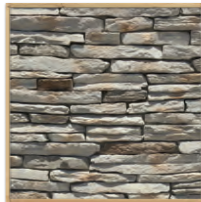
Hamilton Laurel Cavern Ledge