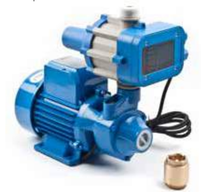
FLOW SWITCH PASSK10

PASCALI self priming PERIPHERAL pump with flow control. For domestic and garden irrigation use. Thermal overload protection, 100% copper winding and brass impeller. 25 mm Inlet & outlet.