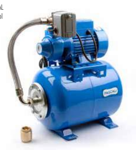
Non-return valve included.

Complete with PAS24L PASSWAY PASFLEXHOSE-2 PASY4010BAR PASSK-2A