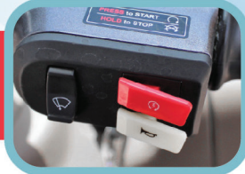
F-TOUCH start SILENT, INSTANT & MAINTENANCE FREE