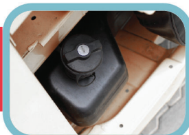
LARGE 15 LITRE PETROL TANK