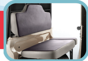
COMFORTABLE LONG DRIVER SEAT