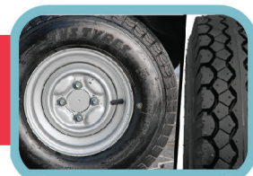
STRONG WHEEL RIM & DEEP TREAD TYRE