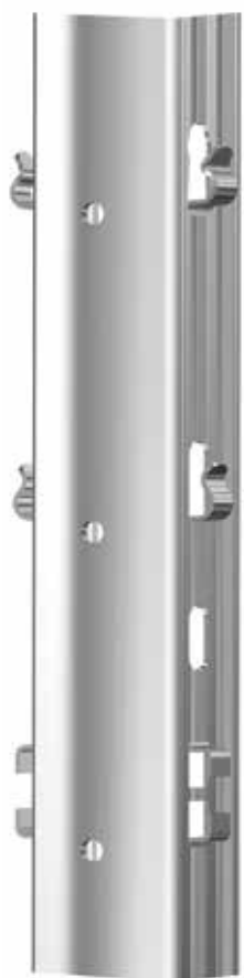
Lower fixed wire area