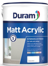
Duram Matt Acrylic