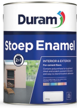
Duram Stoep Enamel