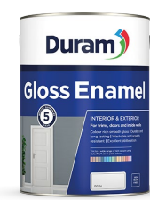
Duram Gloss Enamel