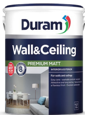
Duram Wall & Ceiling