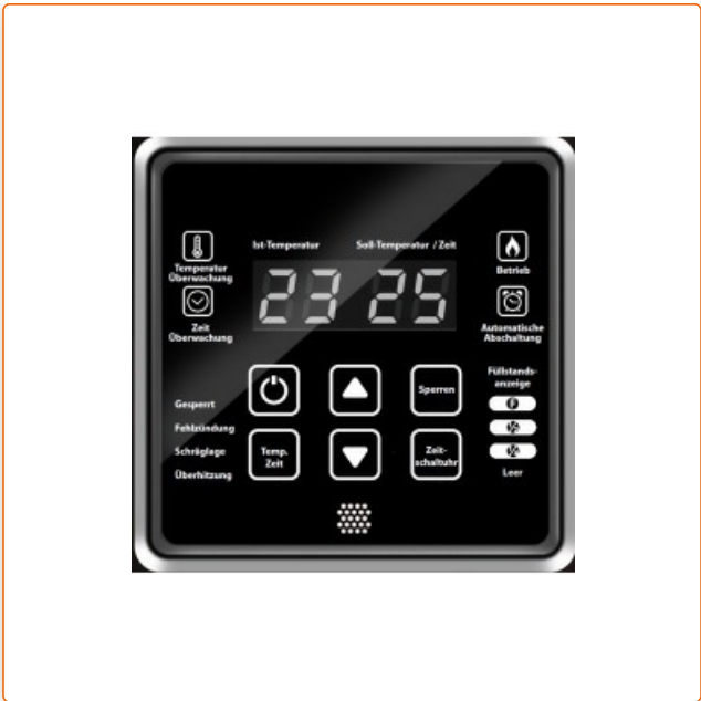
Digital control display